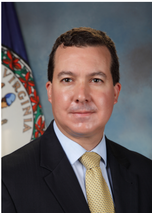
Charles Green, Deputy Commissioner

At VDACS, food safety is a priority. Food safety means knowing how to avoid the spread of bacteria when you're buying, preparing and storing food. VDACS provides several resources and food safety tips to help you practice food safety and to prevent foodborne illness, including FoodSafety.gov , Food Recalls , the Partnership for Food Safety Education and Food Security . Additionally, the new VDACS Handbook for Small Food Businesses is a user-friendly reference to help you practice food safety in compliance with Virginia's regulations. I encourage you to read your handbook thoroughly so that you remain in compliance with the law, so that your business practices food safety and so that you protect consumers' health.