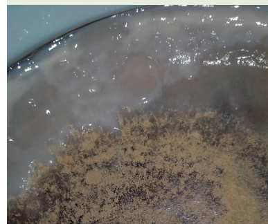
Figure 8. Unhealthy SCOBY – Brown powder kombucha mold on top of the SCOBY.