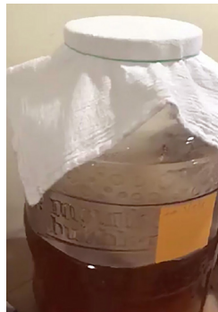
Figure 2. A jar of kombucha fermenting in the open air, covered with cheese cloth.