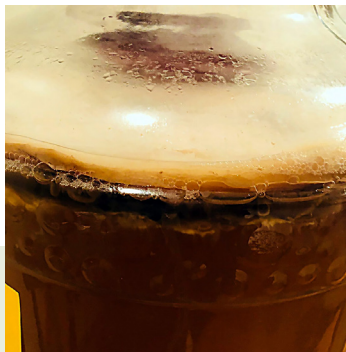
Figure 3. (Top) Healthy SCOBY.