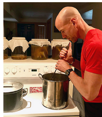
Figure 1 Stirring tea on the stove during preparation of kombucha.

alcohol production must be monitored closely! Food and beverage products that contain greater than 0.5% alcohol may be subject to Alcohol Beverage Control Authority (ABC) and/or Alcohol and Tobacco Tax and Trade Bureau (TTB) regulation and taxation. Additionally, if fermentation continues for too long, excess vinegar may be produced making the product too acidic for frequent consumption.