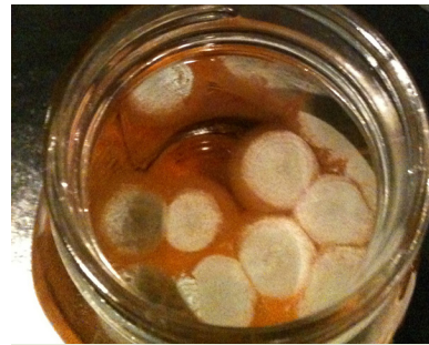
Figure 6. Unhealthy SCOBY – SCOBY on top of the brew covered with white and blue mold.