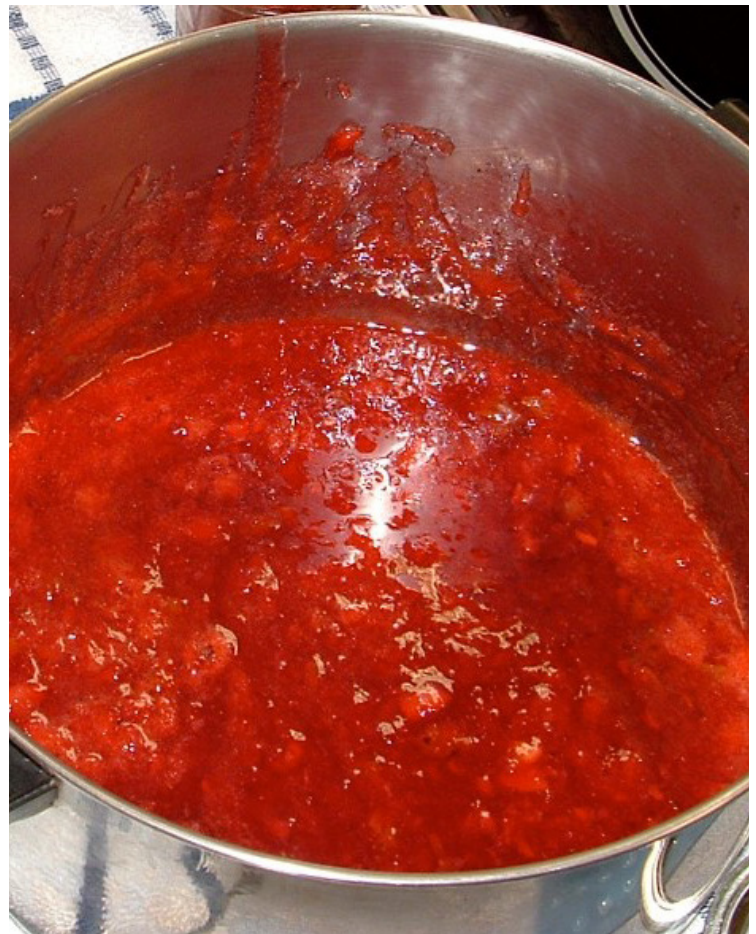
Figure 2. Strawberries that have been boiled to make strawberry jam.