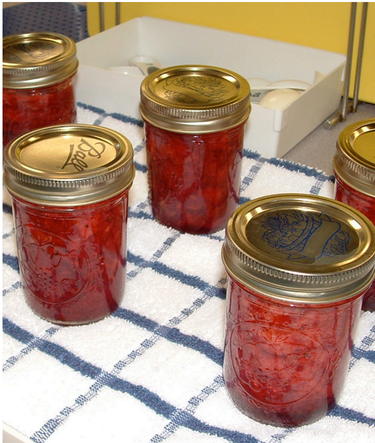
Figure 3. Jam produced and canned in canning jars with sealed lids that have been checked for a good seal.

Homemade jams, preserves, jellies and fruit butters should be sold and stored in canning jars with sealed lids, as shown in figure 3. As with all canned foods, store and sell your products in a cool and dry location. Heat (including storing in a sunny location or trunk of a car) can greatly affect the quality of canned products.