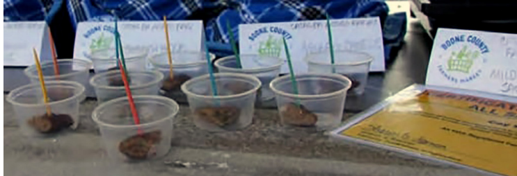
Figure 1. Samples served using single-use cups and toothpicks.