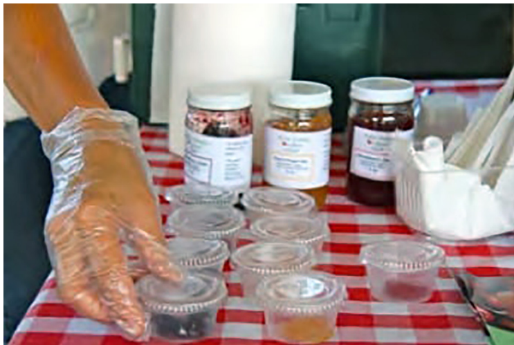
Figure 3. Samples served using closed single-use cups.