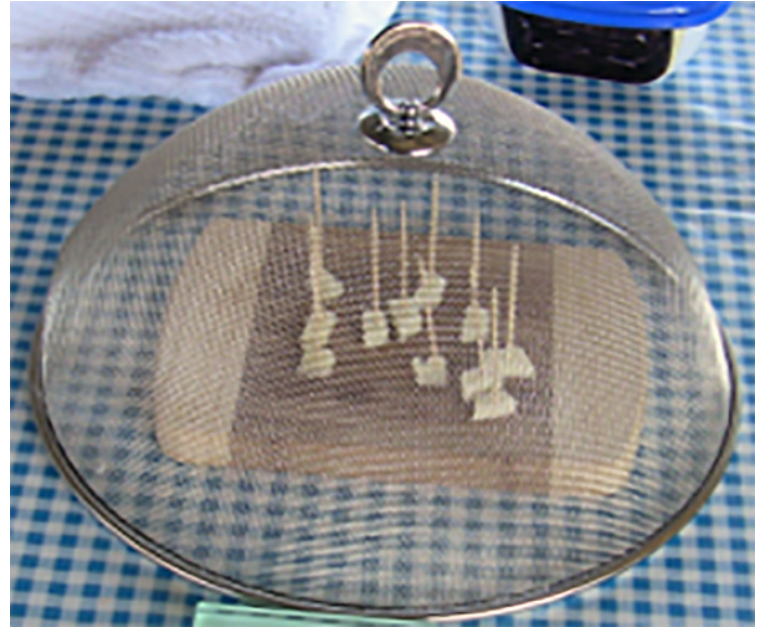
Figure 4. Samples covered and protected with a dome or plastic covering.