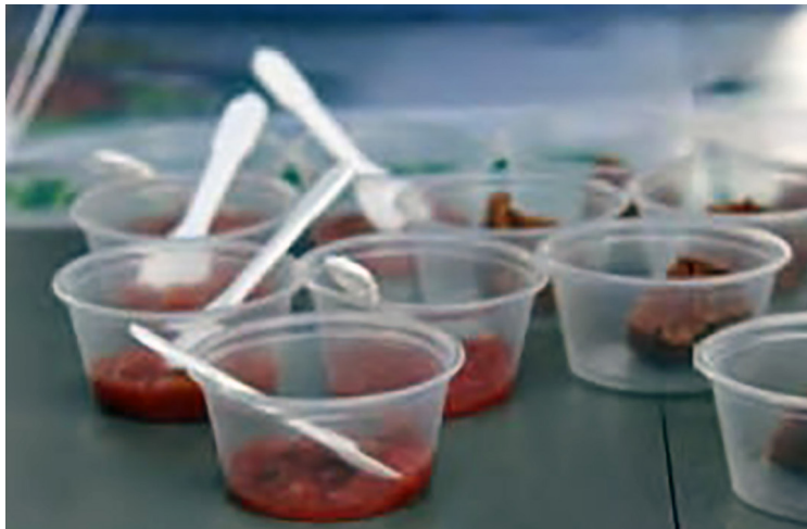
Figure 2. Samples served using single-use cups and single-use spoons.